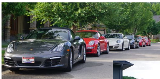
Cars lined up at our first stop

We had a great cross-section of over 30 vehicles across the palate of Porsche offerings plus a Ford Model