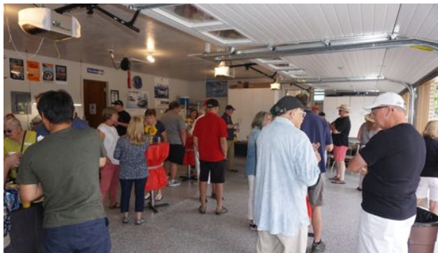
It's a poster museum, nice floor!