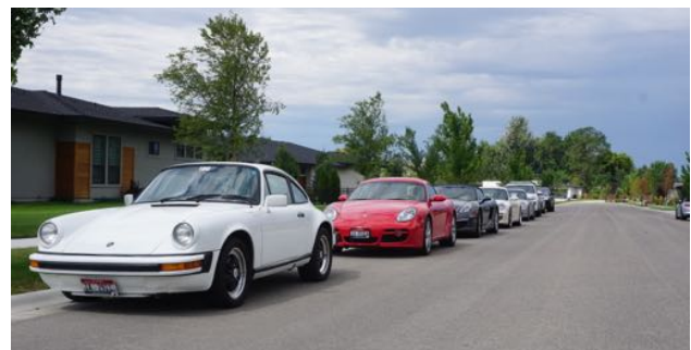
Our third car line up

about an hour of social engagement at each location to converse, look at cars, marvel