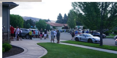
The crowd gathers

car show. What sweetness to see all these cars together. Even the neighbors came out to enjoy the car show. It was a wonderful sense of community on display!