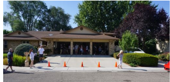
Garage number 2