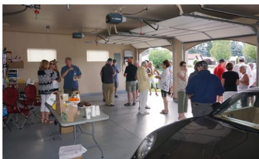
Inside out first garage, solar power system inverter on the wall