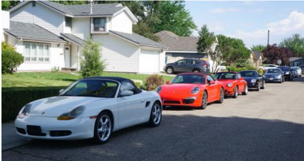
Our next line up of cars

bringing it up at a board meeting. You too can be a host for the next one. So start getting those garages cleaned up. I